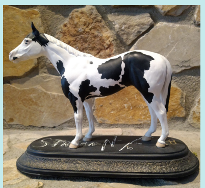
Casting of: Streak N To The Top 16'2" 1,500 lbs Size 2 Shoe